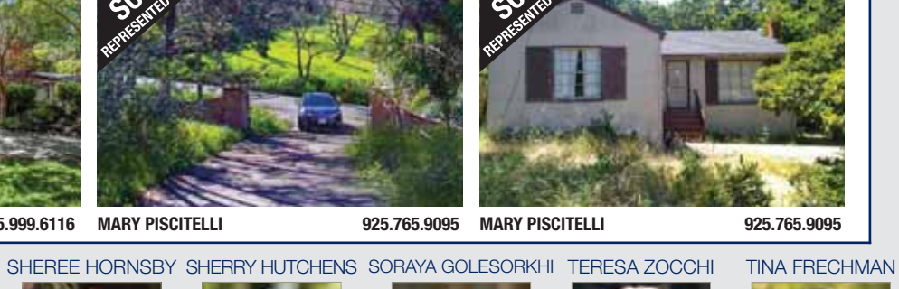
905 DEWING LANE, LAFAYETTE $850,000